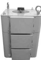
With Casing Terminal Covers

For larger ratings please refer to our MAE-HB-DM-CB SERIES motorised variable transformer range.