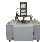
With Casing Terminal Covers